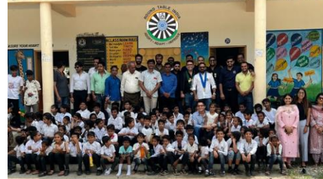
Bhoomipoojan by URT 253 3 Classroom Block at MGGS, Badgaon, Udaipur 30.08.2022